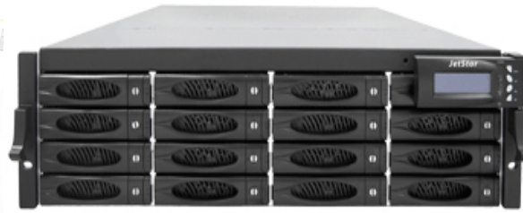
JetStor SAS 716F V2

The JetStor SAS 716F V2 RAID system delivers 1,600 MB/second through 8Gb/sec SAS2 host connections to enable the most demanding applications. Outstanding throughput coupled with fast random access eliminates bottlenecks in your most demanding applications, diminishing response times and increasing productivity. The JetStor SAS 716F V2 RAID system accelerates databases, file servers, production applications, imaging, and any application demanding the instantaneous delivery of records, small and large files.